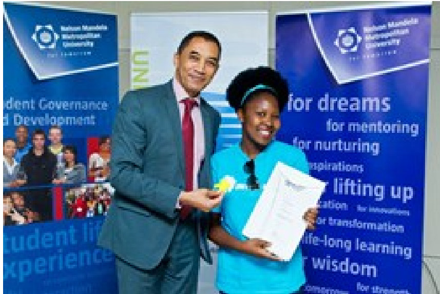
Beneficiary breakdown for the NMMU/UinA Student Volunteer Programme for 2015