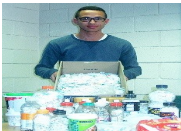
Bread tag handover to the Sweetheart Foundation

The Sweethearts foundation is a non-profit organization that collaborates with companies like Interwaste, The Polystyrene Recycling Company and Zibo in order to recycle plastic tags (and bottle tops). In exchange for 50kg bread-tags or 150kg bottle tops, the Sweethearts gets a wheelchair, which they then hand over to a disabled person. BtC students collected bread tags throughout the year and over 10kgs were handed over to the Sweet Hearts Foundation on Monday 28 September. The hand over was featured on the NMMU webpage https://www.facebook.com/NMMU4U/photos/pb.136889286362813.-2207520000.1448101291./969805939737806/?type=3&theater and the Sweet Hearts Foundation page. https://www.facebook.com/sweetheartsfoundation The Foundation has set a challenge to donate 180 wheelchairs by January 2016